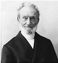
George Muller 1806 - 1898

A mix of 14 members of Bromley Heath Probus and the Y's Men's Club visited the Müller Museum at Ashley Down on 2nd December. It's run by the George Müller Charitable Trust which continues the work of George Müller nowadays all over the world.